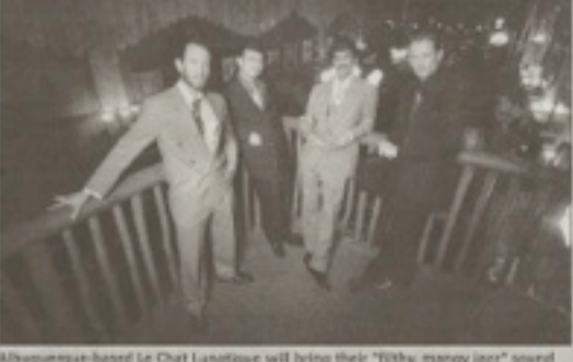
Albuquenque-boord Le Chat Lunotique will bring their "Tithy, mangy jeer" sound to the Rio Grande Theatre Saturday, Jan. 14.